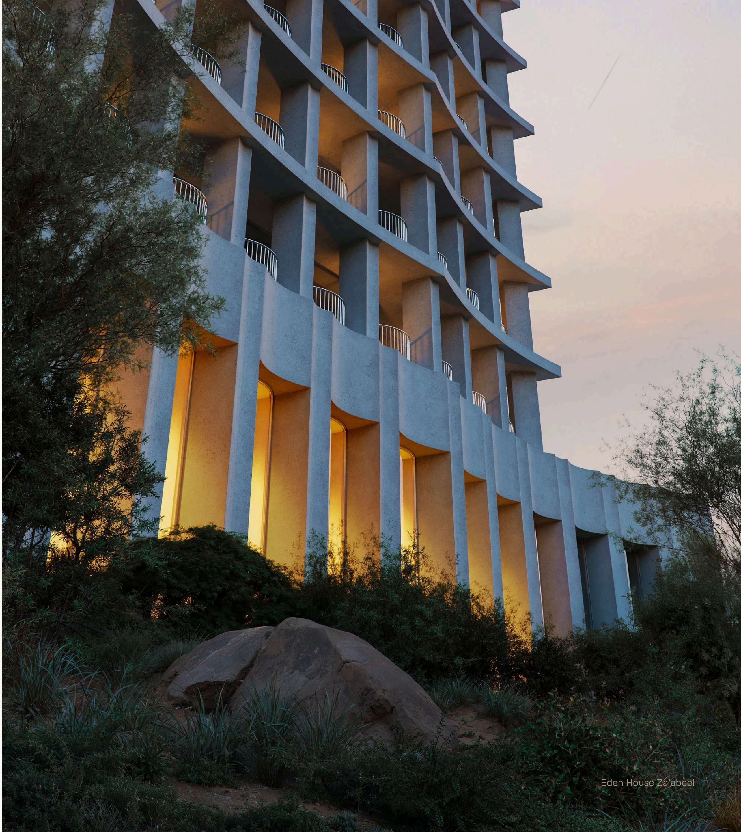
Eden House Za'abeel

H&H Sales Gallery at Eden House Al Satwa Dubai, UAE +971 4 597 6000 info@edenhousezaabeel.ae edenhousezaabeel.ae